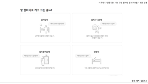
Figure 2: Actual Description in Survey

# 주말 아침에 늦잠을 자고 일어난 나는 인공지능(AI) 스피커와 간단한 인사를 나눈다. 인공지능 스피커는 오늘의 날씨와 뉴스 그리고 서울 근교의 교통 상황까지 꼼꼼하게 알려준다. "신나는 최 신 가요 좀 들려줘"라고 말하니 이내 경쾌한 최신 가요가 흘러나온다. 급하게 나오느라 가스 불 확인을 못했지만 스마트폰을 통해 가스밸브를 차단시켰다. 내가 집에 없어도 현관에 누군가 온다 면 원격으로 대화하고 카메라를 통해 확인할 수 있다.