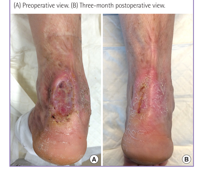
Fig. 3. Infected chronic ulcer (patient No. 7)

able literature to overcome such limitations and to improve cell content, viability, and take (Table 2). The fat was harvested from the lower abdomen, as this has been reported to be the region with the highest ADSC concentration [12,13], although no statistically significant difference in viability has been found compared to other donor sites [14]. Lidocaine has previously been demonstrated to reduce ADSC proliferation and viability, while ropivacaine has been shown to have a negligible effect [15-18]. Epinephrine has not been shown to exhibit any cytotoxic effect [19] and was used in the infiltration solution.