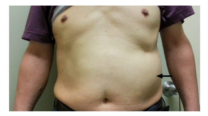
Fig. 1. Photograph of the left rectus abdominis muscle atrophy. The left lateral abdominal wall bulging is present (arrow).

A 52-year-old man was referred to our hospital with acute mediastinitis, empyema, and thoracotomy incision site infection. The patient underwent surgical treatment for esophageal rupture at another hospital, 9 days prior to presentation. On admission, the patient was in a state of septic shock; therefore, we performed