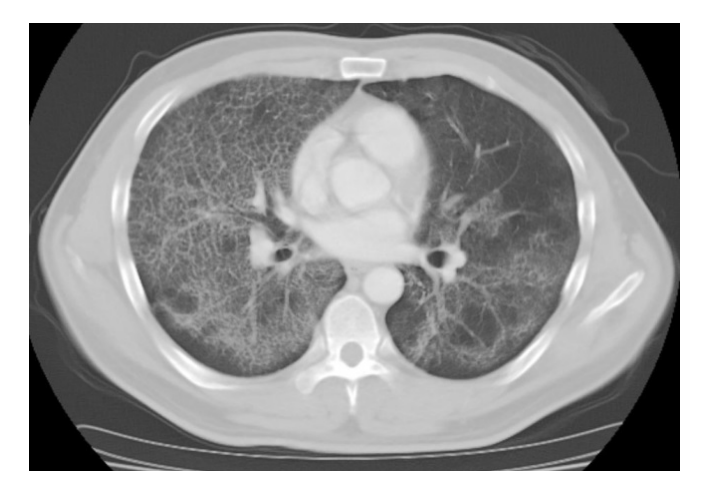
Fig. 1. Pre-whole lung lavage HRCT findings. HRCT scan shows ground glass opacities and crazy paving pattern. HRCT, high-resolution computed tomography.

We administered oxygen (6 L/min) via a nasal cannula. The patient had entered the operation room while appearing to be mentally alert and subsequently, electrodes from an electrocardiogram, pulse oximeter, noninvasive blood pressure (BP) monitor, and bispectral index (BIS) monitor were attached to the patient. The radial artery catheter was placed under local anesthesia to