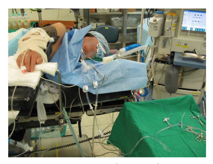
Fig. 3. Left lateral decubitus position (lavage side up) and application of a Y-connector attached to the double lumen endotracheal tube.

PAP was first described by Rosen et al. [6] in 1958, since the accumulation of lipoproteinaceous material in the alveoli lead to nonspecific symptoms such as cough, hypoxemia, and dyspnea. Histopathologic examination reveals that presence of lipoproteinaceous material in the alveoli. Radiographic appearance of PAP are extensive bilateral infiltration on chest radiograph and groundglass opacifications which is commonly referred to as crazy paving on computed tomography images. However, there is often a dissociation between the extent of radiographic abnormalities and severity of the symptoms and physical findings [1], and variable/ nonspecific clinical symptoms delay PAP diagnosis [7]. PAP has been classified into three types according to the developmental