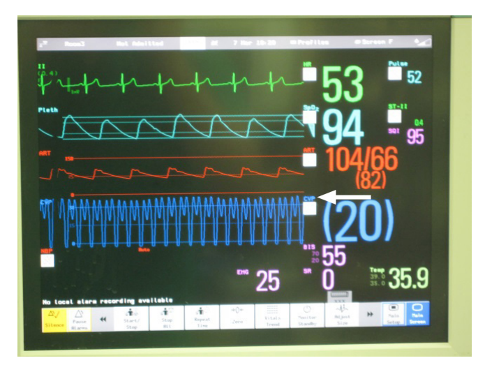
Fig. 4. Intraoperative monitored vital sign denoted as 'central venous pressure' (arrow) shows pressure of injected fluid to the right lung.

There is no consensus regarding the total volume of infusion in WLL, and it varied significantly 5–40 liters of saline [16]. Most institutions repeat the infusion and drainage until the effluent is relatively clear by visual inspection. In a previous case of using a