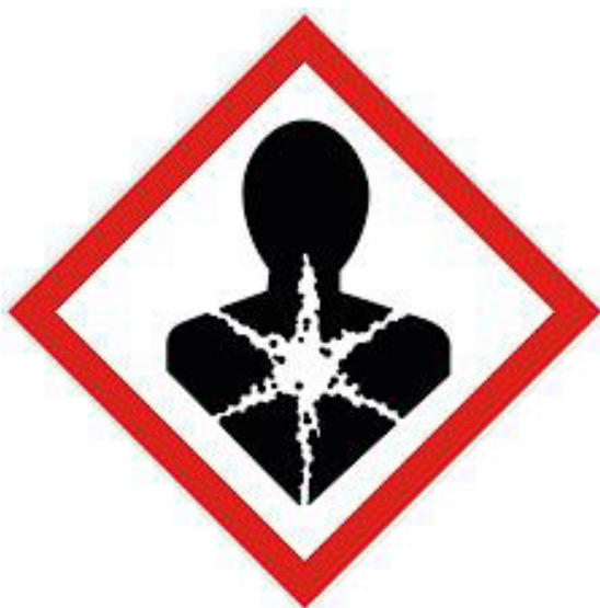
Fig. 1. The symbol for carcinogenicity, mutagenicity or reproductive toxicity based on globally harmonized system (GHS). Reprinted from Occupational Safety and Health Administration [6].

Since 2012, the number of births and TFR in Korea has been declining to its lowest level each year. In 2012, the number of births was about 485,000 and TFR 1.30. In 2017, the number of births was 358,000 and TFR 1.05, falling to the lowest level in the world [7]. According to a 2018 Korean survey of 11,000 women between the ages of 15 and 49, there was an average of 2.2 pregnan-