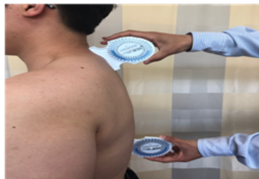
Figure 1. Measurement of the thoracic kyphosis.

This study measured the thickness of the RA, IO, EO, and TrA muscles using ultrasound imaging. The participants relaxed in a supine hook-lying position, with the hip and knees joint in flexion. The evaluator placed a pressure biofeedback unit (Chattanooga, Hixson, TN, USA) under the participants lumbar spine and inflated to 40 mmHg. To activate their abdominal muscles using the drawing-in maneuver, the participants took a relaxed breath in and out, held their breath out, and then drew in their lower abdomen without moving their