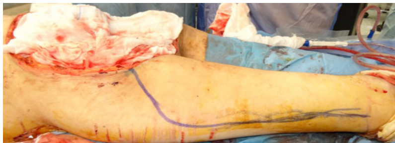
Fig. 2. Posterolateral femur cutaneous incision planned for harvesting the subtotal extended thigh flap.