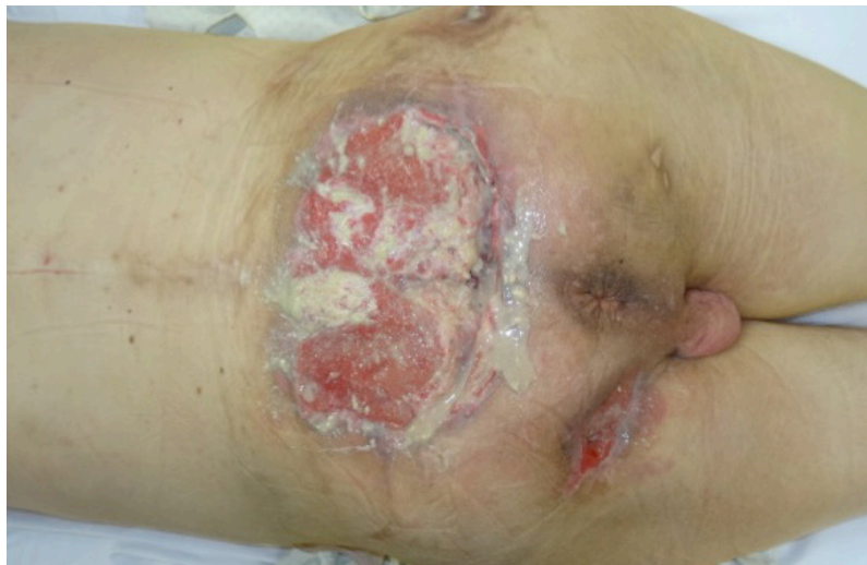
Fig. 1. Marjolin's ulcer on the sacral region involving the posterior surface of the sacral bone.

The only option for radical excision of the tumor was subtotal sacrectomy. Total sacral bone disarticulation between S1 and S2, ligation of the thecal sac, and removal of soft tissue and the residual gluteus muscles were performed. A posterolateral femur incision was made (Fig. 2). The popliteal vessels were ligated. Dissection was carried out through the posterolateral intermuscular thigh septum. The flap was harvested distally to proximally. The hamstring muscles were removed to avoid a bulk effect. We obtained a dually-structured flap, with a myo-fasciocutaneous portion (anterolateral side) and a fasciocutaneous portion (medial side) (Fig. 3). The anterolateral portion of the flap was vascularized by perforators from the superficial and deep femoral arteries, while the fasciocutaneous portion of the flap was supplied by perforators from the profunda femoris artery. The flap surface measured 50 × 38 cm (Fig. 4). The posteromedial component of the flap represented an extension of the flap that allowed the total flap surface to be increased; moreover, the fasciocutaneous component was vascularized by a