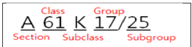
Figure 1: Example of IPC Class

Later, the IT, BT, and NT patents are categorized under representative classes according to the IPC (The International Patent Classification) as technologies are mainly defined under the IPC classes or subclasses when evaluating technological convergence based on patent information (Figure 1). Application and registration of patents which belong to certain IPC classes are extracted according to OECD's IT, BT, and NT categorizing standards (Table 1).