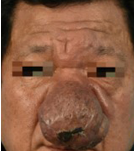
Fig. 1. Preoperative clinical photograph. A male patient presented with a nasal mass of 8×5 cm.