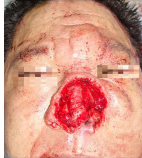
Fig. 3. Intraoperative clinical photograph. The resection resulted in an exposure of bilateral upper lateral and lower lateral cartilages. The defect involved the whole of columella, nasal tip, and left ala. The defect also affected a part of the nasal dorsum and left cheek.

The mass was carefully resected under general anesthesia. The resection resulted in an exposure of bilateral upper lateral and lower lateral cartilages (Fig. 3). The defect involved the whole of columella, nasal tip, and left ala. The defect also affected a part of the nasal dorsum and left cheek. Two flaps, the paramedian forehead flap based on the right supratrochlear artery and the