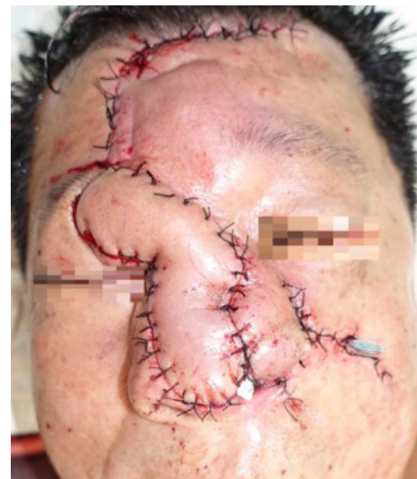
Fig. 4. Immediate postoperative clinical photograph. The paramedian forehead flap based on the right supratrochlear artery and the nasolabial rotation flap from the left side were utilized to cover the defect.

nasolabial rotation flap from the left side, were utilized to cover the defect (Fig. 4). The two donor sites were closed primarily without remarkable disfigurement. The forehead flap was divided 4 weeks after the first operation. Minor surgical refinements were also made with the flap division. Before closing the proximal wounds, excessive soft tissue around the split-site was carefully removed to achieve a good postoperative shape. A wedge resection of the left alar base area was done to correct the superiorly displaced alar. The patient showed good aesthetic results, without any complication or recurrence for 10 months