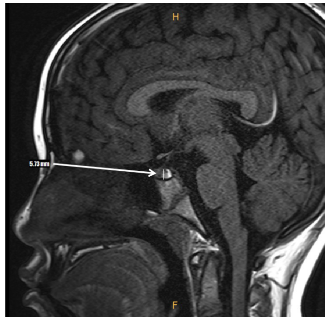
Fig. 2. Brain contrast enhancement T1WI sagittal magnetic resonance imaging. Small cystic lesion (white arrow) appeared between anterior and posterior pituitary gland, representing a small Rathke's cleft cyst.

Epilepsy was another feature that needed treatment. Although the results of her neonatal screening test were all normal, at four years old, a febrile seizure event occurred, with generalized tonic movement, and after then, unprovoked seizure events followed at least twice a year. Those events were