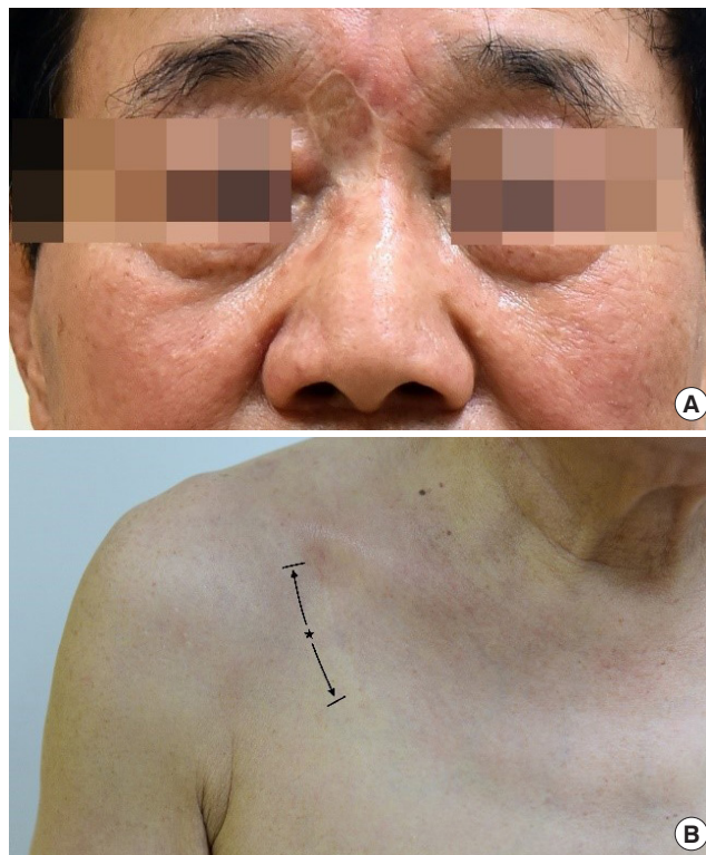
Fig. 3. Postoperative photographs of a 74-year-old man with basal cell carcinoma on the glabella. (A) Recipient site. (B) Donor site. Asterisk indicates donor site scar.

Values are presented as mean ± SD (range) or number. BCC, basal cell carcinoma; SCC, squamous cell carcinoma.