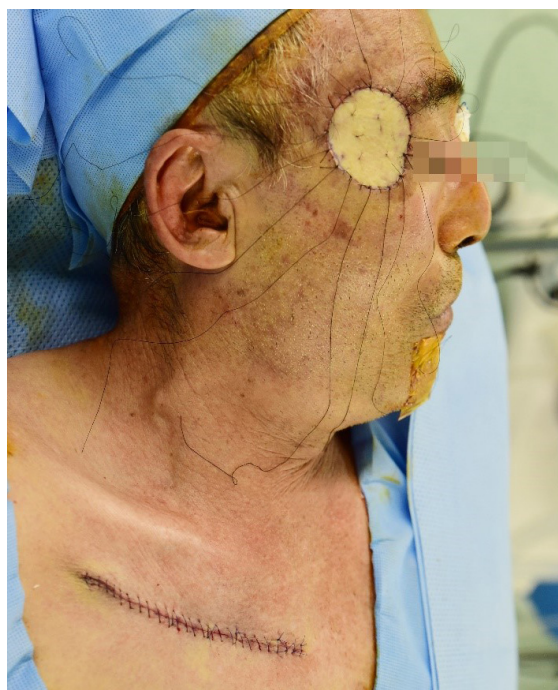
Fig. 2. Immediate postoperative photograph of a 67-year-old man with melanoma on the left malar area.

All results are expressed as mean \pm standard deviation. Statistical analyses were performed using the SPSS software version 22.0 (IBM Corp., Armonk, NY, USA).