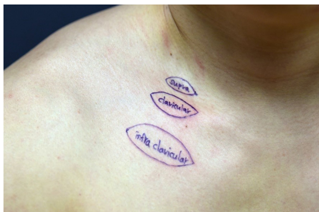
Fig. 1. Donor sites for full-thickness skin grafting on the face. Supraclavicular, clavicular, and infraclavicular areas.

The surgery was performed under general anesthesia. The excision line was designed to include a safety margin of > 3 mm for BCC and > 5 mm for SCC around the cancer lesion. The infraclavicular donor site was designed to be elliptically shaped (Fig. 1). Two operators simultaneously performed the cancer lesion resection and skin harvesting from the donor site. The pathologist processed the frozen biopsy to ensure that the excised lesion margin was clear (i.e., cancer was not involved). The residual adipose tissue was trimmed, and the graft was fixed on the