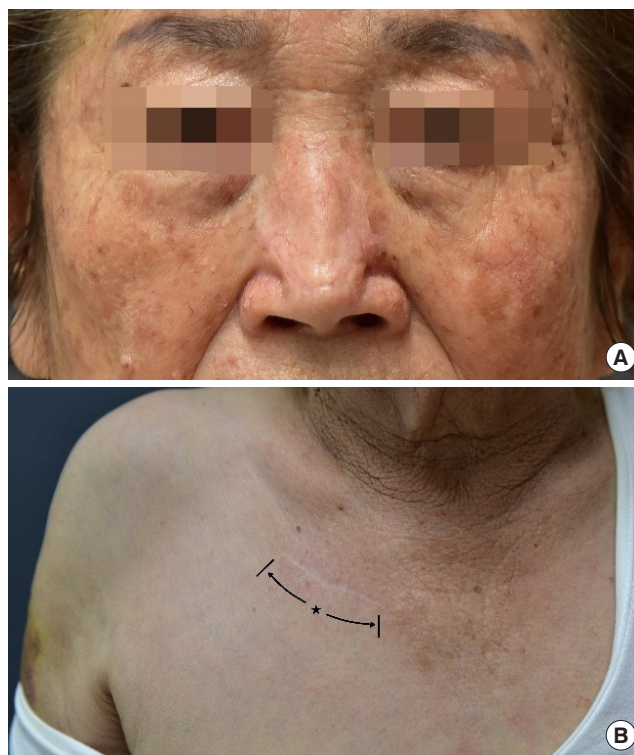
Fig. 4. Postoperative photographs of a 78-year-old woman with basal cell carcinoma on the nose. (A) Recipient site. (B) Donor site. Asterisk indicates donor site scar.