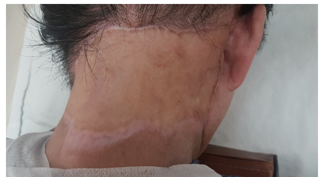
Fig. 4. Postoperative findings 1 year after surgery. There were no complications.

Necrotizing fasciitis, which is mainly caused by group A \beta -hemolytic Streptococcus , has a low occurrence rate. However, it causes rapid ischemia in soft tissue within fascia, leading to nonreciprocal damage and a high fatality rate if diagnosis and treatment are delayed. This disease occurs mainly in the lower extremities, as well as the perineal and abdominal regions. Its occurrence rate is relatively high in immunocompromised patients with underlying high-risk factors such as advanced age, chronic liver disease, and alcoholism [3]. External factors such as lacerations, insect bites, injections, and surgery-induced skin damage can cause necrotizing fasciitis in patients with no underlying diseases [4]. The fatality rate can be as high as 20% to 50%, and it is critical to perform immediate antibiotic treatment and surgery to reduce the risk of death [5]. Systematic toxicity can occur faster in cervical necrotizing fasciitis than in any other type of necrotizing fasciitis, possibly causing fatal complications due to direct transmission of the bacteria [1]. Necrotizing fasciitis should be carefully differentiated from skin infection caused by an abscess, which is limited to the dermis and subcutaneous space and manifests as a painful, fluctuant,