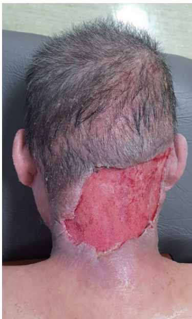
Fig. 3. Postoperative findings 1 month after negative-pressure wound therapy.

tion of range of motion or other complications (Fig. 4). The study was performed in accordance with the principles of the Declaration of Helsinki. The patient provided written informed consent for the publication and the use of his images.