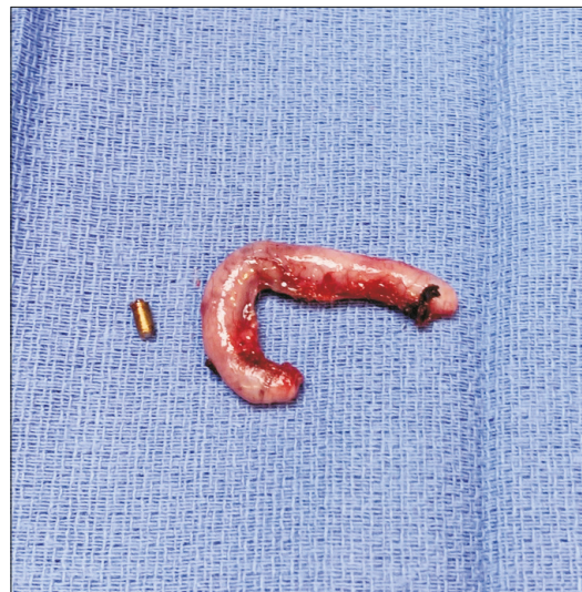
Fig. 3. Gross specimen with the foreign body extracted.

suggested the foreign body was within the appendix ( Fig. 2 ). Colonoscopy with foreign body removal was planned. However, no foreign body was visualized within the terminal ileum, cecum, or appendix during colonoscopy. Due to the risk of developing appendicitis from an appendiceal foreign body, pediatric surgery elected to perform a diagnostic laparoscopy and laparoscopic appendectomy. The surgeon noted slight dilation in both the distal and proximal portion of the appendix, and the object was palpable within the appendix during the operation. Upon removal, a small metallic foreign body was found and sent to pathology ( Fig. 3 ). Interestingly, Enterobius vermicularis were also identified in the specimen.