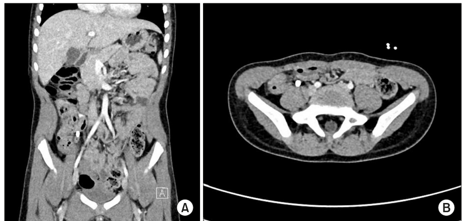
Fig. 2. Computed tomography scan showing a retained appendiceal foreign body on (A) coronal and (B) axial sections.