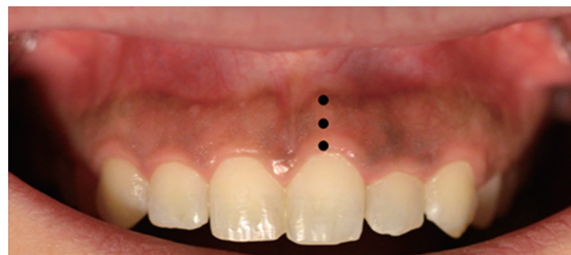
Fig. 1. Measuring points distributed along the keratinized gingiva.

The study population comprised 259 Spanish adults who met the following inclusion criteria: patients older than 18 years of age and younger than 85 years; patients with a plaque index 34 less than or equal to 25% 35,36 and a gingival bleeding index of less than 10% 36 ; no visible melanin stains in the study area; the presence of at least a 2 mm-band of vestibular keratinized gingiva; and the presence of at least 1 tooth adjacent to the right and left of the selected incisor. The present study was satisfactorily evaluated by the Bioethics Committee of the University of Salamanca (USAL_2015-23.11), and after the participants were selected ( n = 259 ), they provided informed consent following the ethical precepts formulated in the Helsinki Declaration of the World Medical Association on ethical principles for medical research in humans. The study was approved by the ethical review board of the authors' institution. All participants signed a consent form, and the color coordinates were measured 3 times (with removal and new replacement of the spectrophotometer measurement system) in the 3 reference areas located in the keratinized gingiva of 1 of the central incisors (Fig. 1). 37,38