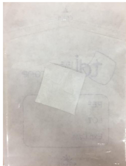
Fig. 1 Commercialized silk mat used for this study