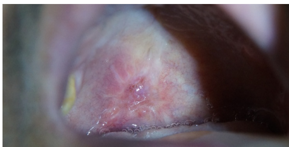
Fig. 3. One month after surgery.

surgery. The initial soft-tissue incision (2 cm in diameter) resulted in a defect on the soft palate (2.5 cm × 3 cm). At this point, the nasal palate mucous membrane was preserved (Fig. 1). Thereafter, MegaDerm ADM (L&C Bio, Seoul, Korea) was designed and cut to match the defect. After the defect was covered, a tie-over dressing was placed using 4-0 Vicryl sutures (Ethicon; Johnson and Johnson, Livingston, UK) (Fig. 2). The patient stopped oral diet temporarily until postoperative day(POD4) and received total parenteral nutrition(TPN) to provide adequate nutrition. In addition, the patient underwent a betadine gargle every 2 hours to maintain his intra-oral hygiene. On POD 7, the stitches from the tie-over dressing were removed. Successful graftuptake without loss was observed and the patient was followed up after discharge. The patient has recovered fully without extrusion of the reconstructed area or complications (i.e. infection, dysphagia, dysarthria, fistula) (Fig. 3). Furthermore, functional aspects including articulation and deglutition were also preserved.