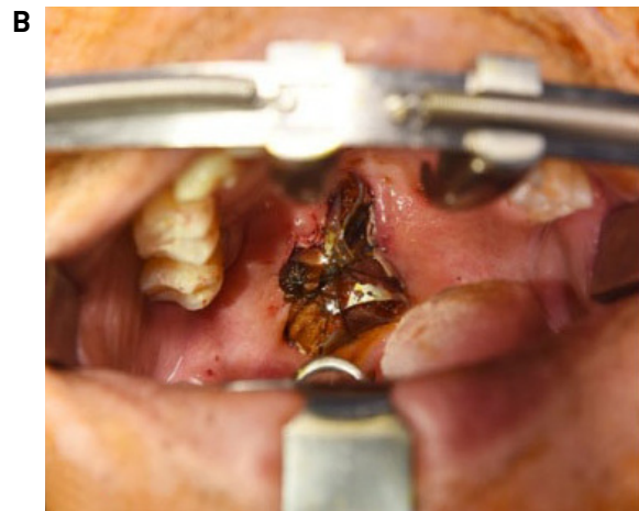
Fig. 2. An ADM was trimmed and applied according to the defect size and (A) tie over dressing was applied. (B)