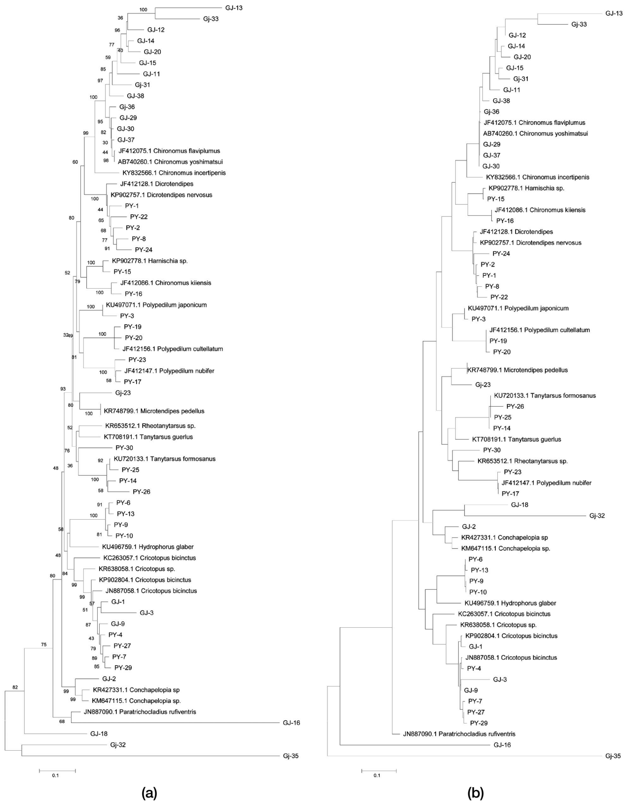
Fig. 2. (a) Neighbor-joining (NJ) tree and (b) Maximum likelihood (ML) tree of K2P distances based on mtDNA COI (1,000 bootstrap replicates). Bootstrap values are on branches; Scale = K2P distance.