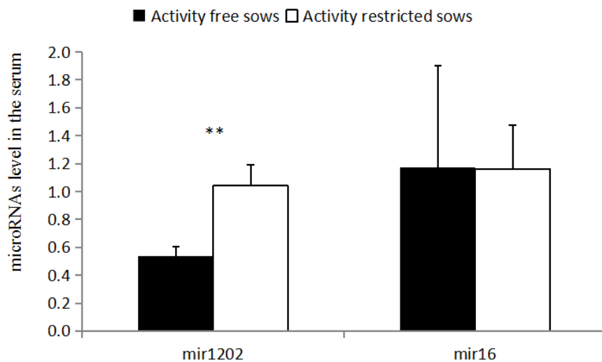
Figure 2. Levels of miRNA in the serum. The data are presented as the means \pm stand error of mean, and n = 4 for each group. ** Means with significant differ ( p < 0.05 ) and ( p < 0.01 ).

nificant correlation ( p > 0.05 ) for miR-16.