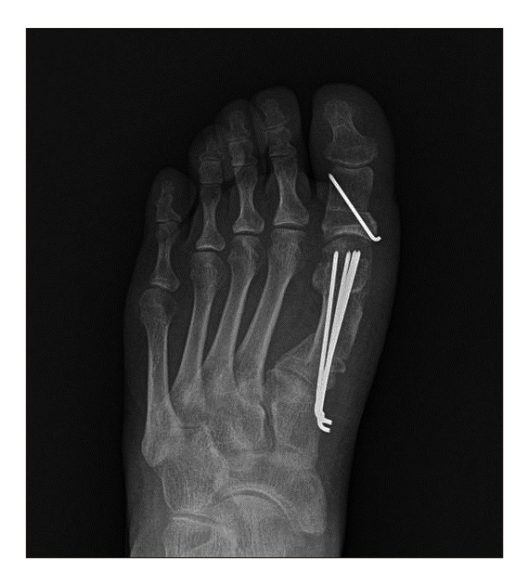
Figure 4. Postoperative radiograph shows satisfactory reduction of hallux valgus deformity.

the metatarsal head. The correction was then checked using C-arm fluoroscopy (Fig. 2). The Kirschner wires were buried under skin and a bone graft was prepared using resected bone, and was placed in the gap of the osteotomy site (Fig. 3). The medial joint capsule was repaired using absorbable sutures, and correction was rechecked using C-arm fluoroscopy after wound closure (Fig. 4).