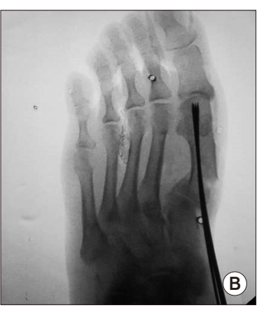
Figure 2. (A) Intraoperative photograph shows the distal fragment was medially translated. (B) Fluoroscopic image shows medial displacement and lateral angulation of the distal fragment.