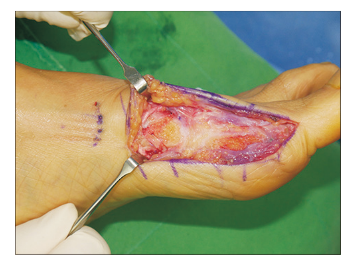
Figure 3. The bunion is removed and a bone graft is prepared using resected bunion, and is placed in the gap of the osteotomy site.