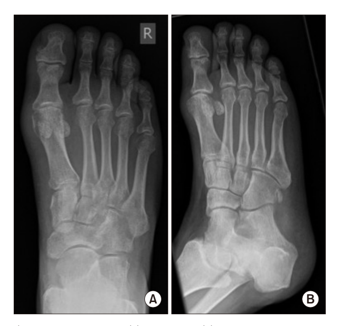
Figure 1. Anteroposterior (A) and oblique (B) plain radiographs at the time of presentation.

The histology of the samples revealed a non-specific inflammatory arthropathy, with no signs of gout and the soft tissue samples grown S. mitis sensitive to penicillin and clarithromycin. The microscopy of the synovial fluid did not reveal any crystals. After discussing with our microbiologist colleagues a course of six weeks of oral clindamycin 450 mg every 6 hours was started. The patient was given a short walker boot for mobilising.