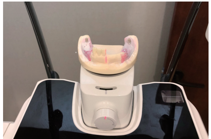
Fig. 1. Cone-beam computed tomography taking of study model.

The STL and DICOM data were imported into a dental software program (R2GATE v1.1.1, MegaGen, Daegu, Korea) for computer-aided implant surgery planning and guide fabrication. Using volume rendering, the DICOM data were reformatted as a 3D reconstruction image with which the surface scan data were merged. The image registration was conducted manually by designating 3 congruent points from the two images. The registration process was carried out two times per each operator with different matching conditions (Fig. 2). In the first matching, matching points were limited to the remaining teeth. In the second matching, the scan cap images were included as matching areas, as well as the tooth image. Twelve dental graduates who were blinded to the purpose of study and had same the working year in the dental filed, participated in this study. While performing the registration process, working time was recorded for each condi-