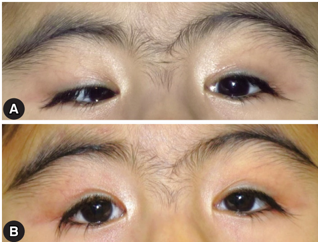
Fig. 2. Preoperative image of the patient demonstrating esotropia and ptosis covering the visual axis of the right eye (A). Four months after surgical treatment, the patient had stable ocular alignment with good eyelid position (B).

A 7-mm resection of the lateral rectus and 6-mm recession of the medial rectus were performed on the right eye without augmentation. The frontalis sling procedure was performed for the treatment of right ptosis. Four months later, the patient had stable ocular alignment with good eyelid position (Fig. 2B).