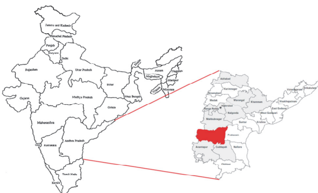
Figure 3: Map showing Andhra Pradesh state (inset) and Kurnool district (in red)

To analyze the economic performance of PMFBY and compare its performance with earlier agricultural insurance schemes in India, the secondary data pertaining to area insured and number of farmers insured are collected from the Agriculture Insurance Company of India Limited (AIC); Agricultural Statistics at a Glance, Ministry of Agriculture and Farmers Welfare, Directorate of Economics and Statistics and www.indiastat.com . In order to understand ground level working of PMFBY and other major crop insurance schemes, Kurnool district was purposively selected, as it is one of the major drought prone districts in Scarce Rainfall Zone of Andhra Pradesh (Figure 3). Despite being the largest of the four districts of Rayalaseema region, Kurnool district remains the backward region of Andhra Pradesh. It is identified as being in the Scarce Rainfall Zone of Andhra Pradesh, with an annual rainfall of 500 to 750 mm (average rainfall in the state is approximately 670 mm). In this district, the primary data are collected from sample farmers through a field survey in two mandals viz., Kurnool and Adoni (100 farmers from each mandal) pertaining to issues/constraints in implementing crop insurance schemes and for suggesting a crop insurance scheme to be farmer-friendly, climate resilient and economically viable in the future. Informal discussions are also held with the officials of cooperative and commercial banks to cross check the information supplied by the sample farmers.