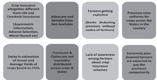
Figure 4: Issues and Constraints of Insurance Schemes in India

Before planning the possible potentials for scaling up in agricultural insurance, the important pitfalls/issues are identified based on the informal discussions held with farmers and bankers in Kurnool district (Figure 4).