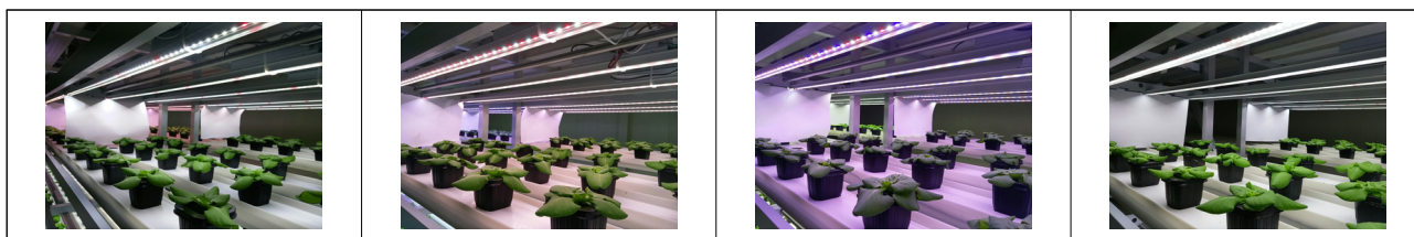
Fig. 1. Heading lettuce ‘Fidel’ and NFT system in the plant factory used in this experiment.

The basic nutrient solutions used in the experiment were shown as follows (Table 1). AMG is composed of complex active minerals (Dr. Mineral®, 1.6%, 23 minerals, Eco-biotec Co., Ltd., Hwaseong, Korea) and natural highly active calcium (CaO, 0.03%, Eco-biotec Co., Ltd., Hwaseong, Korea). As for the chemical properties of AMG, the purity and ionic activity of CaO are high through heat treatment. Also, the ionic activity is 3 to 5 times higher than that of calcium oxide. The high calcium contained in AMG weakens the binding force of oxygen and the electrons are very unstable, but it reacts well with atoms and is easily water uptake (Eco-biotec, 2019). AMG