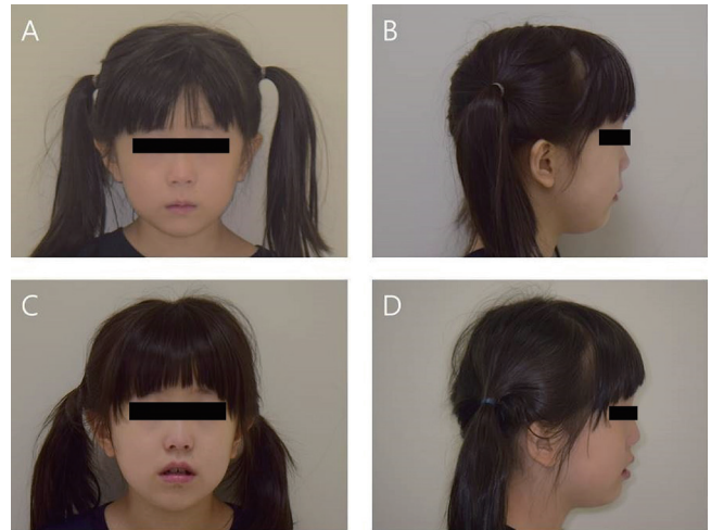
Fig. 6. Extraoral photos before (A, B) and after (C, D) treatment in case 2.