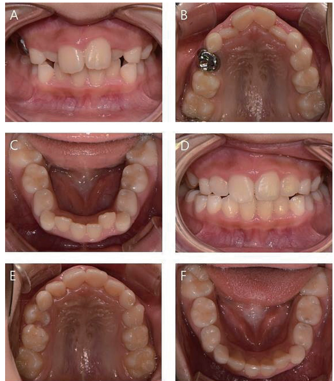
Fig. 4. Intraoral photos before (A, B, C) and after (D, E, F) treatment in case 1.

In home respiratory polygraphy, AHI was 1.8 and average SpO 2 was 96.2%. According to an interview with the patient's mother, oral habits included mouth breathing and nocturnal bruxism. Considering AHI and SDB symptoms, the patient was diagnosed with pediatric obstructive sleep apnea.