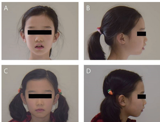
Fig. 3. Extraoral photos before (A, B) and after (C, D) treatment in case 1.