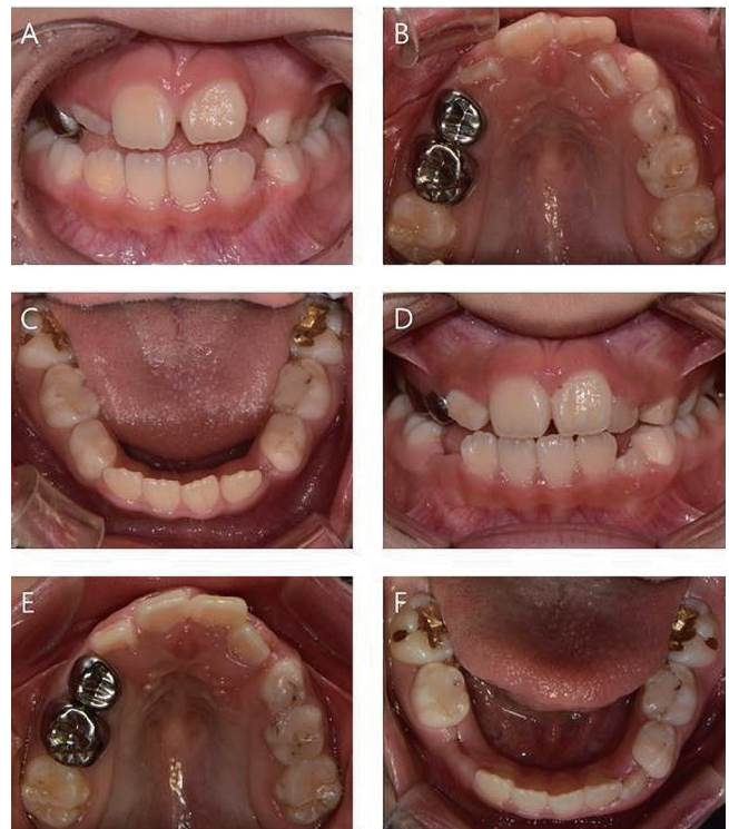
Fig. 7. Intraoral photos before (A, B, C) and after (D, E, F) treatment in case 2.