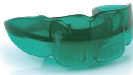
Fig. 1. Prefabricated appliance for myofunctional therapy.

After 6 months of treatment, U1 to SN reduced from 110.2° to 101.1° and an IMPA increased from 94.4° to 96.8° (Fig. 2, Table 1). Overjet reduced from 7.2 mm to 3.7 mm, and overbite from 3.4 mm to 2.3 mm. Nasolabial angle and L-nasolabial angle increased from 80.9° to 91.1° and 68.8° to 71.3°, respectively. AHI had decreased from 1.3 to 0.6, and average SpO 2 had increased from 96.6% to 97.2%. Oral breathing reverted to nasal breathing, and moderate lip competence with a decrease in bruxism were noted (Fig. 3). Intercuspid width between the centers of the dento-gingival junctions of deciduous canines had increased from 23.5 mm to 24.5 mm in the maxilla and from 19.7 mm to 20.8 mm in the mandible. There were no significant changes in bimolar width between the centers of dento-gingival junctions of the first permanent molars. Both upper and lower anterior crowding showed improved alignment (Fig. 4).