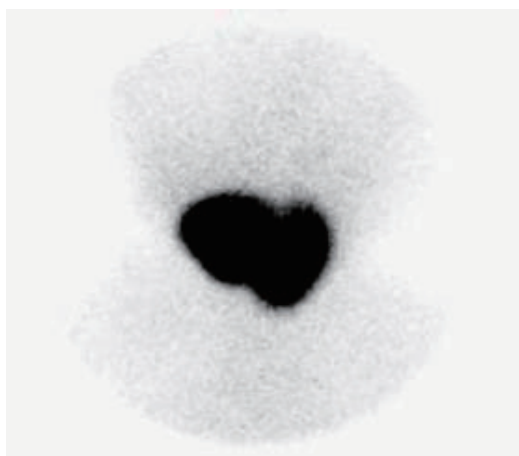
Figure 2. Technetium-99m thyroid scan showing homogeneously enlarged thyroid glands with markedly increased activity.

thyroid glands (Figure 1). Moreover, 99m technetium thyroid scanning performed on day 26 of hospitalization showed diffuse thyroid enlargement and increased thyroid uptake (Figure 2). The thyroid function test performed 1 week after levothyroxine administration revealed no improvement in the TSH level; hence, the levothyroxine dosage was increased to 15 µg/kg/day. Subsequently, the TSH level decreased while FT4 and T3 levels showed an abnormal increase, based on which levothyroxine administration was discontinued. The thyroid function test performed after discontinuation of levothyroxine administration revealed a TSH level of 85.0 µIU/mL, FT4 level of 4.80 ng/dL, and