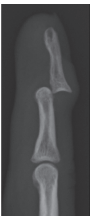
Fig. 1. Preoperative radiographs of the right small finger demonstrating dorsal dislocation of the distal interphalangeal joint.

in the ulnar fingers on the injured side. However, this was attributed to irritation of the brachial plexus secondary to the clavicular fracture. His fingers were not meticulously examined, nor did he undergo radiographic evaluation. Open reduction and internal fixation of the clavicle were performed a week after the injury. At 7 weeks after the injury, the patient complained of restricted motion and pain at the DIP joint of the right small finger. The radiograph of the injured hand demonstrated dorsal dislocation of the distal phalanx (Fig. 1). Eight weeks after the injury, the patient was examined by one of the authors. No gross deformity was noted on inspection (Fig. 2). The active range of motion was restricted from -20° of extension to 40° of flexion. Open reduction was performed 10 weeks after the injury under digital block anesthesia. The DIP joint was explored through a radial mid-lateral incision. The collateral ligament was intact. Reduction at this occasion was unsuccessful; therefore, the proximal end of the radial collateral ligament was released. The volar plate was found avulsed from its proximal attachment and was interposed between the distal and middle phalanges. The articular surface of the distal phalanx was covered by scar