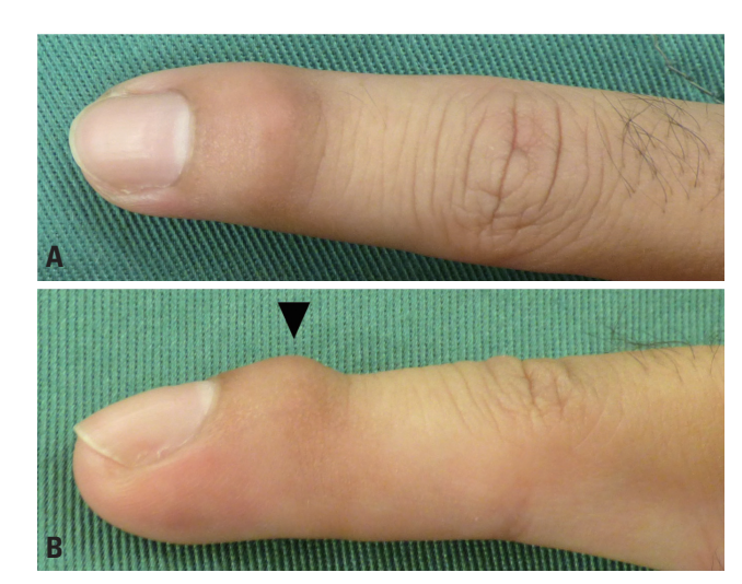
Fig. 2. Preoperative clinical photograph of the right small finger demonstrating no apparent deviation at the DIP joint from the dorsal view (A) and the slight protrusion at the dorsum of the DIP joint (B, arrowhead). DIP: distal interphalangeal.

tissue and a chondral fragment. The fragment seemed to be detached from the dorsal aspect of the distal end of the middle phalanx. Both the extensor and the flexor mechanisms were uninjured. After removing the scar tissue and the chondral fragment, the DIP joint was easily reduced and held at 0° of extension with a Kirschner wire (Fig. 3). Subsequently, the collateral ligament was repaired