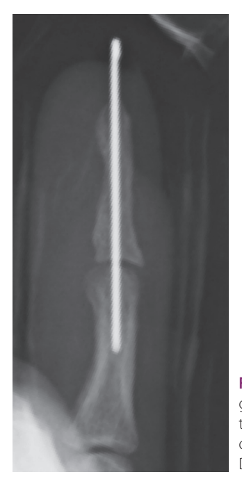
Fig. 3. Postoperative lateral radiograph demonstrating joint reduction. The DIP joint was held at 0° of extension with a Kirschner wire. DIP: distal interphalangeal.