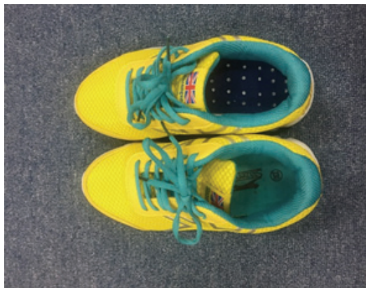
Fig. 2. Normalized shoe with a 2 cm insole lift-inserted on the right side

a total of 8 to 10 walk trials. The order in which the shoes were worn (normalized shoe, 1 cm insole lift-inserted right shoe, or 2 cm insole lift-inserted right shoe) was assigned randomly before the walking trials began.