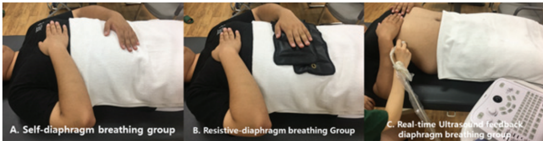
Fig. 2. Three groups according to diaphragm breathing method

the sandbags during inspiration and expiration. The sandbag weight was applied differently for each subject and at levels 11 to 13 of 'Rating of Perceived Exercise (RPE)'. The UFDBG applied breathing exercises while in the supine position, visually identifying live motion images of the diaphragm provided by the tester using a real-time ultrasound imaging device. The breathing exercise for each group were conducted in two sets for 15 minutes with a five-minute break between the sets. A sufficient 10 minute break was allowed after completing the breathing exercises. All diaphragm breathing exercises were conducted under the guidance and supervision of one examiner (Fig. 2).