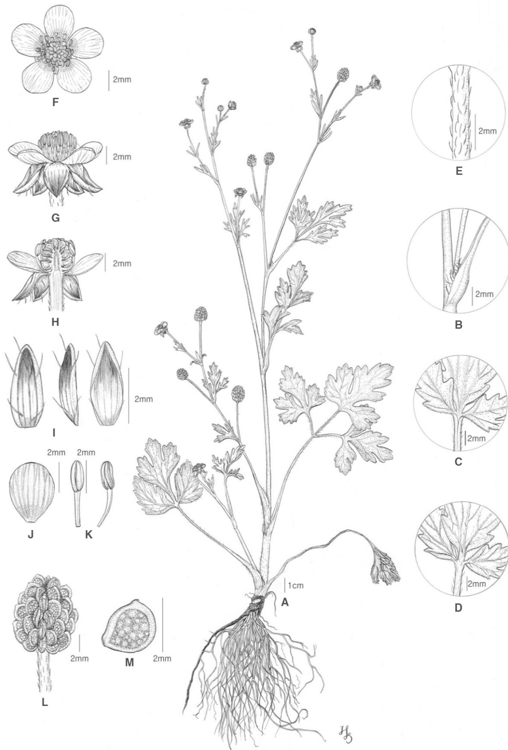
Fig. 2. Illustrations of Ranunculus sardous Crantz. A: Habit, B: Stem and petiole, C: Adaxial leaf surface, D: Abaxial leaf surface, E: Trichomes on peduncles, F-H: Flower, I: Sepals, J: Petal, K: Stamen, L: Aggregated fruit, M: Achene.