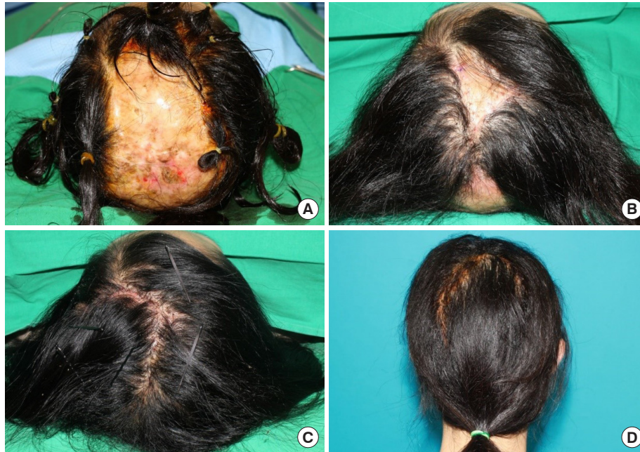
Fig. 2. A 20-year-old woman patient (case 1). (A) Preoperative image (vertex view). The hairless scalp size was estimated as 23×16 cm (368 cm 2 ) from the frontoparietal to upper occipital area. (B) Immediate postoperative image after bilateral parietal scalp expansion, partial removal of hairless scalp, and insertion of tissue expanders in the frontal and occipital areas (vertex view). There remained 13×10-cm (130 cm 2 ) and 5×8-cm (40 cm 2 ) hairless lesions in the parietal and occipital areas, respectively. (C) Immediate postoperative image after serial expansion of the frontal and occipital areas, complete removal of the hairless scalp, and coverage with expanded flaps (vertex view). (D) Follow-up image 15 months after operation shows good hair density and distribution (posterior view).