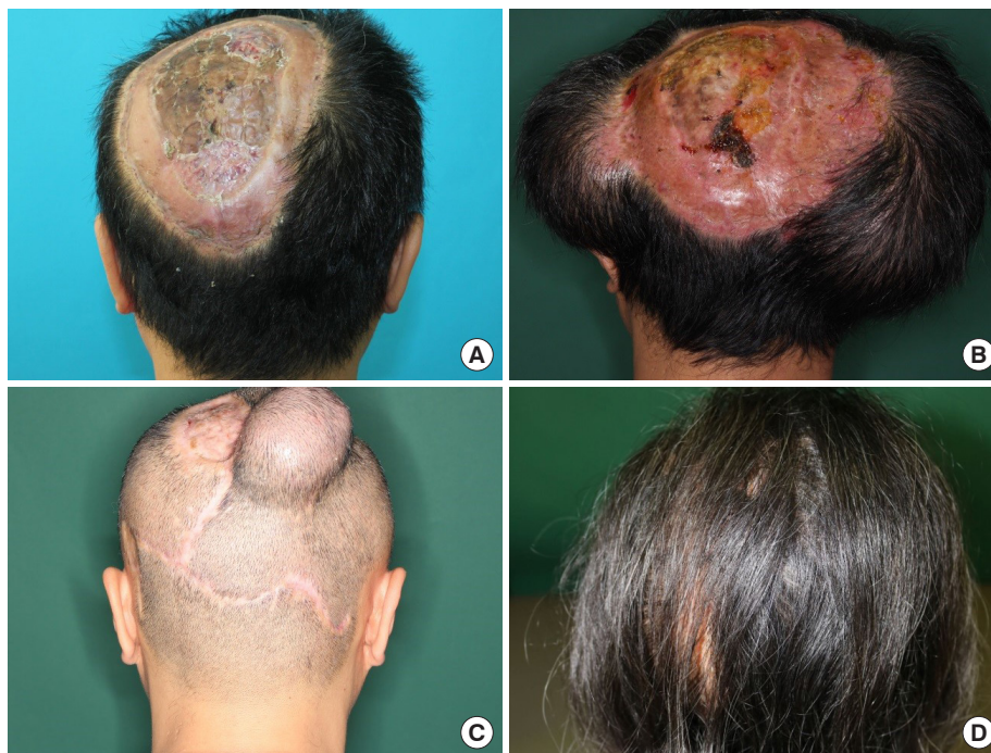
Fig. 3. A 42-year-old man patient (case 2). (A) Preoperative image (posterior view). There was a hairless scalp lesion sized 16×9 cm (144 cm 2 ) after dermatofibrosarcoma protuberance resection. (B) Image after full expansion of the first tissue expander (posterior view) (left: 250 mL/smooth rectangle and right: 550 mL/smooth rectangle; Mentor). (C) Preoperative image before the final operation (posterior view). After removal of the first expander and resurfacing, a 5×6 cm (30 cm 2 ) remained. The second expander was inserted into the previously expanded flap in the upper occipital area. Full expansion state (100 mL/rectangle, Mentor). (D) Follow-up image showing successful scalp resurfacing 9 months after the final operation (posterior view).