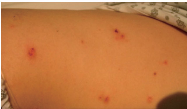
Fig. 1. Erythematous papular rash with partial crusted lesions.

On posttransplant day 42, a consultation was requested to the pediatric infectious diseases physicians for the evaluation of persistent intense itching sensation and any possible skin infection.