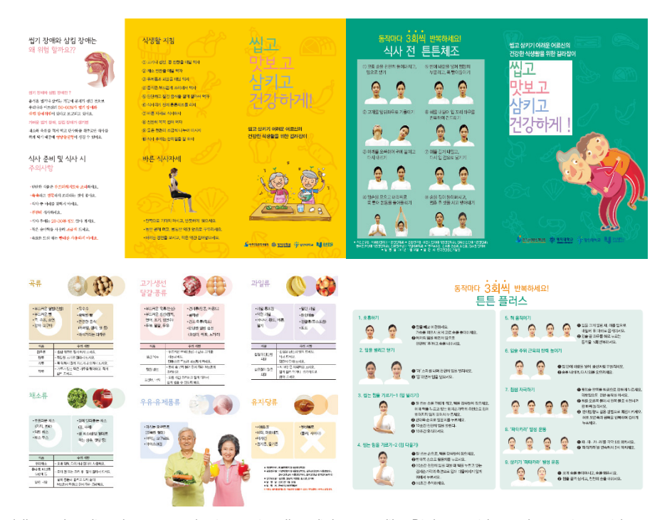
Fig. 2. Contents of the educational program for improving the dietary quality: Dietary guide and exercise guide

The educational program was administered to the experimental group. Guides including dietary (food, cooking, and menus) and exercise (posture at mealtimes, 'Health Stretching', and 'Health Plus Stretching') were