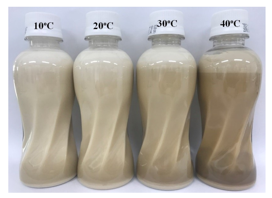
Fig. 1. Visual appearance of LIF after storage for 6 mon at different temperatures.

formula is more susceptible to the MR than bovine milk owing to the high content of lactose (Albalá-Hurtado et al., 1999; Ferrer et al., 2000). Thus, the MR can be accelerated by storage conditions and affects the color of LIF during storage.