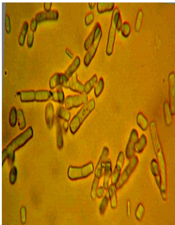
Figure 1. Oidium Phlebiopsis gigantea

From Table. 1 shows that sawdust is the most preferred stimulator of oid growth.