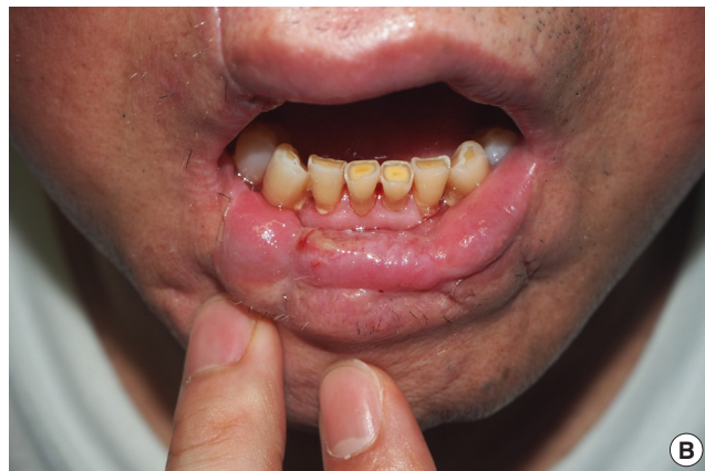
Fig. 4. (A) Three months after Abbe flap coverage, a vermilion apron flap was performed to correct the drooling and whistle deformity of the central lower lip. (B) Result after vermilion apron flap coverage.