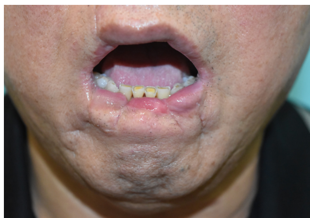
Fig. 5. Result at 6 months after surgery.