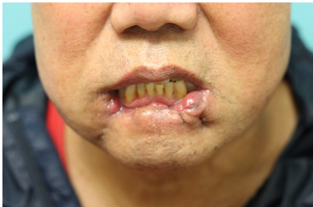
Fig. 2. As a result of extensive soft tissue necrosis caused by acute fungal stomatitis, 3/4 of the entire lower lip was affected, with a full-layer skin defect extending from the vermilion to the gingivobuccal sulcus at the corner of the mouth.