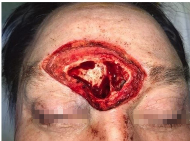
Fig. 6. Intraoperative photograph. Wide excision with removal of the frontal sinus posterior wall mucosa before immediate reconstruction.