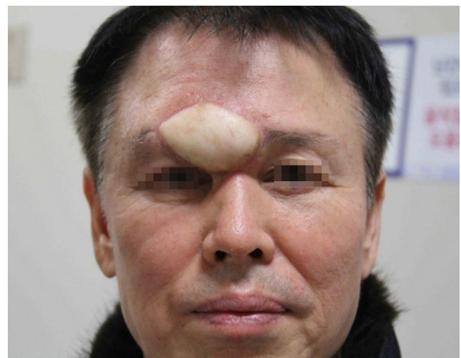
Fig. 8. Postoperative follow-up photograph at the outpatient clinic after 76 days.