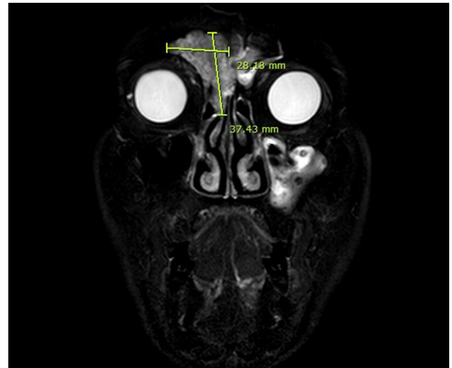
Fig. 3. Magnetic resonance imaging. Soft tissue enhancing mass at the right frontal sinus with extrusion through the right frontal sinus anterior wall. Suspicious extension to the left forehead and extension to the right ethmoid sinus and upper nasal soft tissue area was observed.