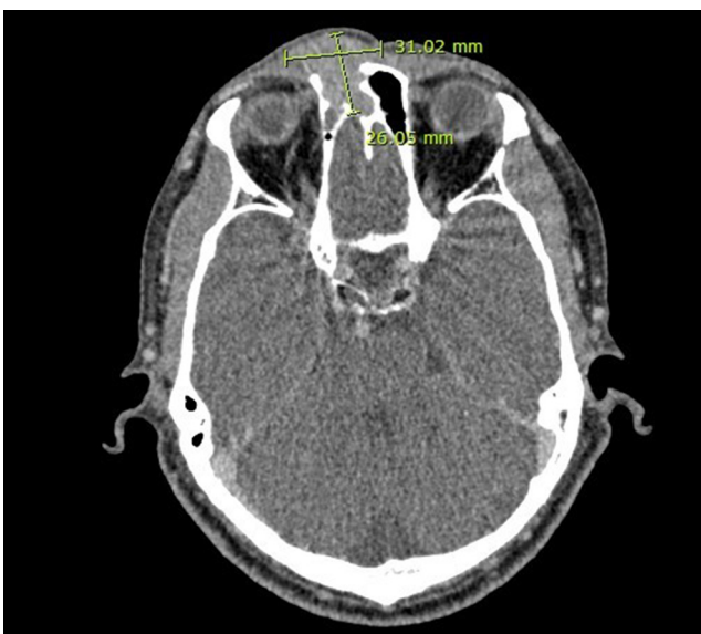
Fig. 2. Contrast computed tomography. A 3.1 × 2.6 × 2.0 cm soft tissue mass at the right fronto-ethmoidal sinus destructing the outer table of the frontal sinus wall.