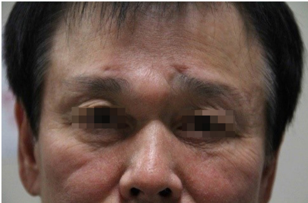
Fig. 1. A 63-year-old man with a painless soft mass on his glabellar region.

the right fronto-ethmoidal sinus destructing the outer table of the frontal sinus wall (Fig. 2). Our impression was a sinus-origin tumor. Thus, ultrasonography-guided fine needle aspiration was performed and a small, round cell malignancy was found on liquid-based cytology. For further evaluation, magnetic resonance imaging (MRI) (Fig. 3) and positron emission tomography scans were performed and no evidence of distant metastasis or metastatic regional lymph nodes were found. For histologic confirmation, we attempted a transcutaneous open biopsy through the elevated skin and the final pathology report was sinonasal intestinal-type adenocarcinoma (Figs. 4, 5). As this histologic finding could be related to a primary GI tract malignancy, we additionally screened for GI malignancies using endoscopy; no evidence of GI malignancy was found. Residual cancer