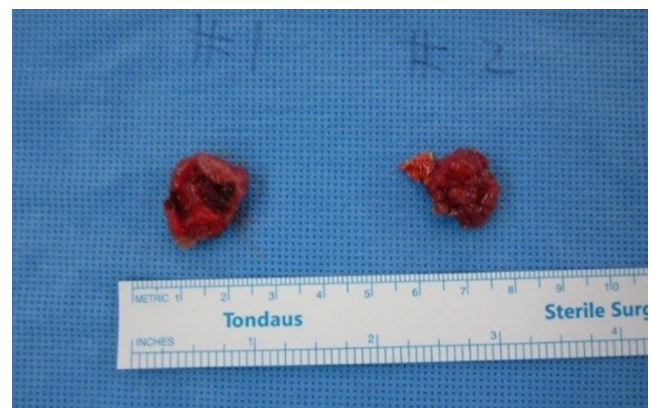
Fig. 4. Open biopsy gross photograph. Sinonasal intestinal-type adenocarcinoma (mass #1 and #2).