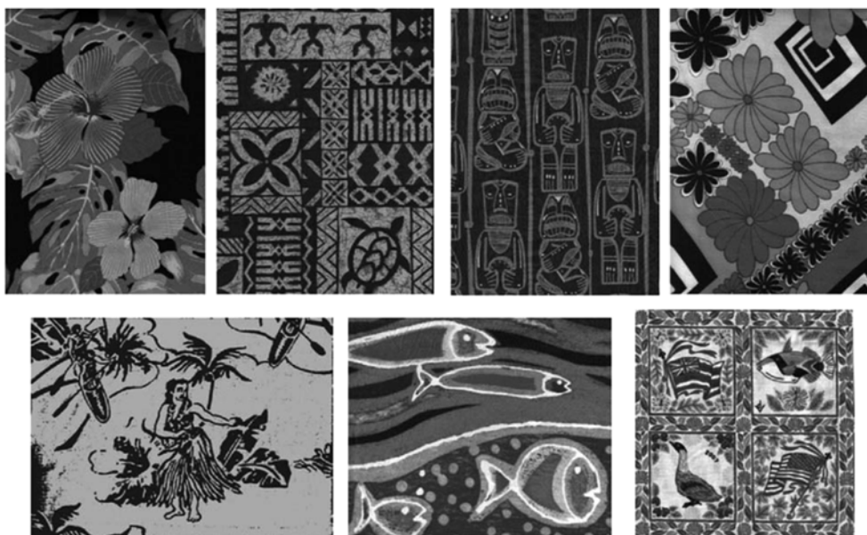
Fig. 3. Seven prints represented or long time good sold in the Hawaiian shirt market in Hawai‘i: from the left top to right – hibiscus, kapa, tiki, kitsch (or retro): from the left bottom to right – hula dancers, fish, and the state bird (nene goose).

The researchers employed a convenience sampling method by initiating contact with owners of retailers or wholesalers who are