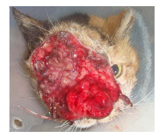
Fig 1. Photographs of Cat 1 showing the facial mass shortly after being rescued from the street.

of blood tests were all within normal range, including serum aspartate transaminase (AST; 76 U/L; normal range, 28-106 U/L) and globulin (4.9 g/dL; normal range 2.8-5.1 g/dL) concentrations, although the total protein concentration was high (8.6 g/dL; normal range 6.6-8.4 g/dL). Serological tests showed that the cat was negative for feline leukemia virus (FeLV) antigen and antibody against feline immunodeficiency virus (FIV). Findings on thoracic and abdominal radiology and abdominal ultrasonography were not specific. Skull radiography revealed soft tissue masses in the right orbital and extra nasal levels with increased opacity of right nasal cavity. Computed tomography (CT) of the head and neck showed an extensive, aggressive nasal mass with heterogeneous enhancement in both nasal cavities and in the