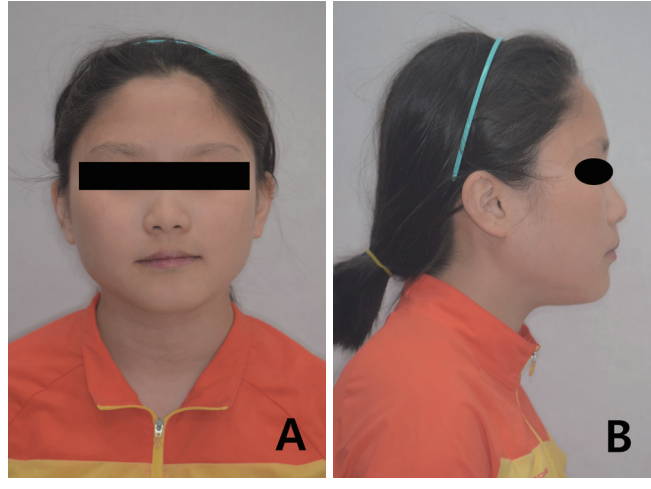
Fig. 2. Extraoral lateral photograph. The patient exhibited low and webbed neck and abnormally low posterior hairline which is characteristically found in patients with TS.

Oral examination showed the hypomineralized type of generalized enamel hypoplasia, with opaque lesions and brown discoloration, in the entire erupted dentition (Fig. 3). Dens evaginatus was detected in all premolars, but not in the bilateral mandibular second premolars where endodontic treatment had been undergoing. The previous crown shape of the bilateral mandibular second premolars, which were pain sites, could not be confirmed as the treatment had been initiated already. However, given that acute pain occurred suddenly on both sides without caries, the pain was presumed to be due to the fracture of the tubercle of dens evaginatus.