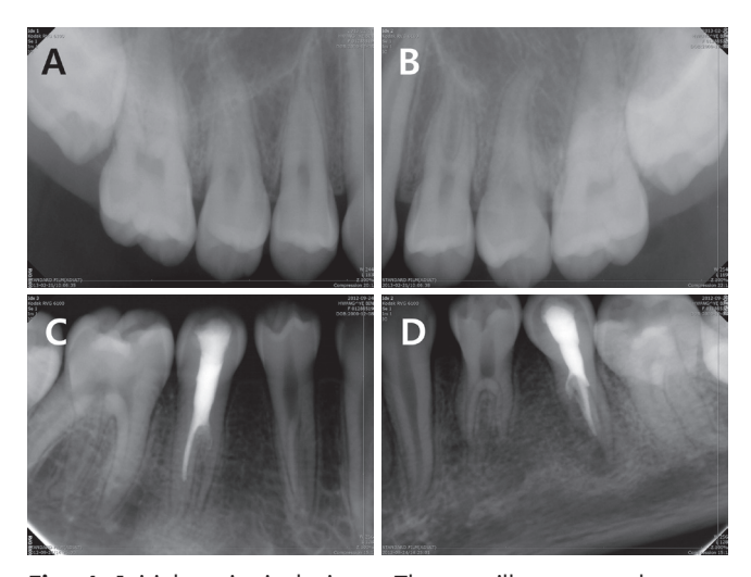
Fig. 4. Initial periapical views. The maxillary premolars exhibited dens evaginatus. Taurodontic root morphology and complicated root canals were observed in all mandibular premolars. (A) Maxillary right premolars, (B) Maxillary left premolars, (D) Mandibular right premolars, (E) Mandibular right premolars.

Selective grinding and pit and fissure sealing were scheduled for the other premolars with dens evaginatus, and after 4