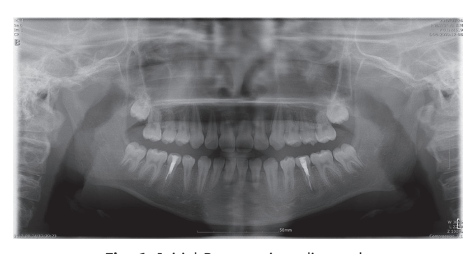
Fig. 1. Initial Panoramic radiograph.

The patient exhibited abnormally low posterior hairline which is characteristically found in patients with TS (Fig. 2).