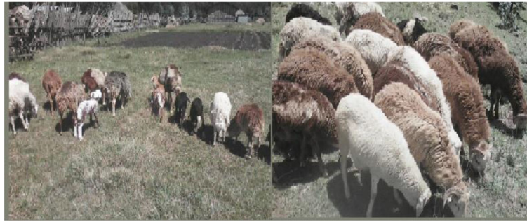
Fig. 3 Local Wollo highland sheep breed on private natural pasture grazing area