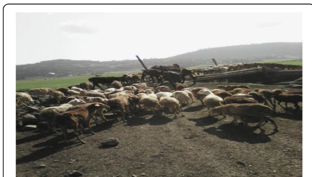
Fig. 2 Communal mixed livestock production system in the study area

The study areas classified in to three strata. They are called as first, second and third strata and the first, second and third strata were comprised of Awassi rams F 1 crossbred progenies, Washera rams F 1 crossbred progenies, and local Wollo highland progenies, respectively. The study areas classification performed by the assumption availability of ¾ Awassi and pure Washera rams and their F 1 crossbred lambs, a comparable number of sheep population, agro-ecology similarity, flock management system, breeding strategies and farmers' breeding objectives resemblance. The main feats of data collection conducted through questionnaire survey, flock monitoring, participatory focus group discussion. Thus, producers' sheep flock size and composition, breeding objectives, sheep breeding strategies, and flock structure information gathered via questionnaire survey and group discussion.