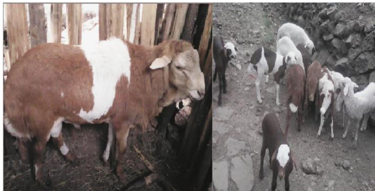
Fig. 4 Washera ram and its crossbreds on village community based breeding scheme

Thus, these proportions mean that; when 3 households drawn from local Wollo highland sheep breed owners, at the same time there should be 2 and 1 households draw from Washera rams F_1 crossbred progenies and Awassi rams F_1 crossbred progenies owners, respectively. In this way, the sample drawn as proportional to size stratified method from each stratum. According to this proportionality, the sampling ratio was calculated using addition of proportions (3 + 2 + 1), which gave as six, as value of total proportion. Finally, it divided to the smallest proportion, which equals to 1 by the total proportion of 6, and the sampling ratio were, 0.17 \approx 0.2 ( or \frac{1}{6} ) for all strata.