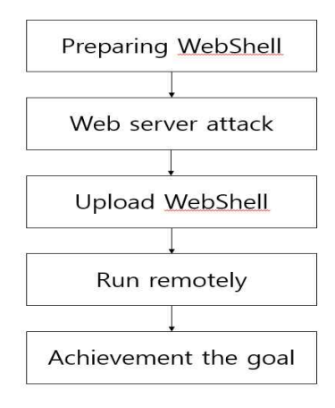
[Fig. 1] WebShell attack process

The damage caused by WebShell is so large that the web server where WebShell is found has a distribution of 91% among the hacked web servers that are damaged. It is difficult to detect. Because of this feature, WebShell is widely used for web server hacking[3].