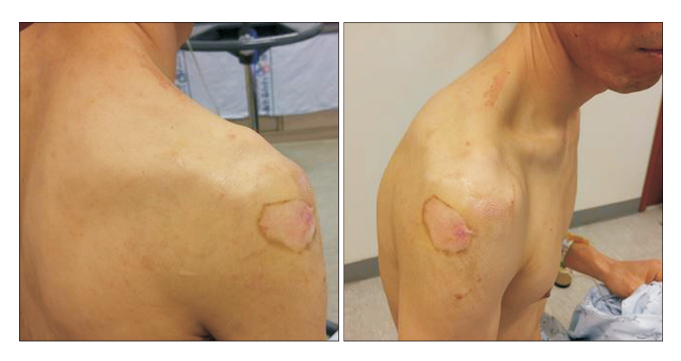
Fig. 1. Second degree burn wound on the deltoid area 3 weeks after the injury.