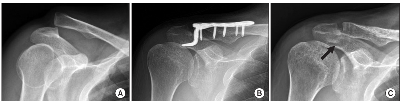
Fig. 1. Serial radiographs of a 36-year-old man treated with a hook plate fixation for acromioclavicular joint dislocation. Preoperative (A) and postoperative 4 months (B) showing good maintenance of joint reduction and subacromial erosion (arrow) after plate removal (C).