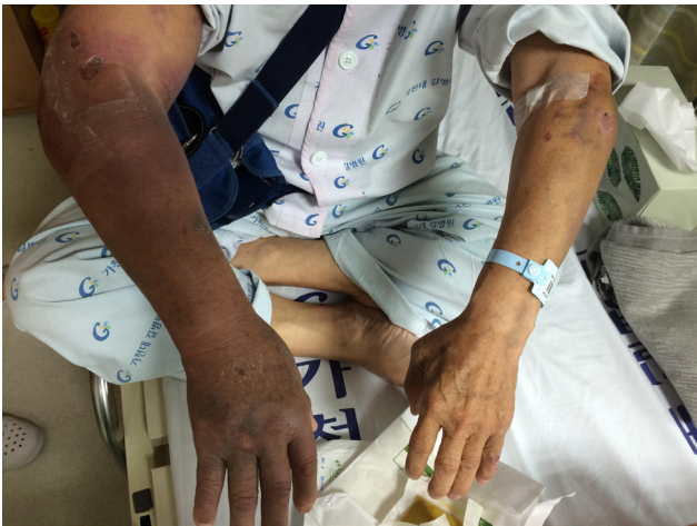
Fig. 2. Aggravated swelling and pain on right arm below axilla.

echocardiogram revealed normal cardiac function except relaxation abnormality of left ventricle filling pattern (early diastolic transmitral velocity to early myocardial velocity ratio=10). On 12th hospital day, the patient complained of aggravated swelling and pain on his right upper arm (Fig. 2). The laboratory examination showed increased serum D-dimer of 2.25 ug/mL, which was slightly higher than the value five days before (1.98 ug/mL). Emergent brachial computed tomography (CT) angiography showed a deep vein thrombus (DVT) extending from cephalic vein to brachial vein along with hematoma and