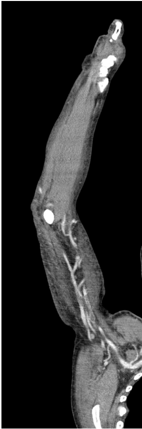
Fig. 3. Computed tomography angiography. The presence of a thrombus extending from right cephalic vein to brachial vein.

Secondary UEDVTs are those associated with various factors like malignancy, central venous catheter, oral contraceptive use etc. Trauma is reported to be responsible for 3-17% of secondary UEDVT [2].