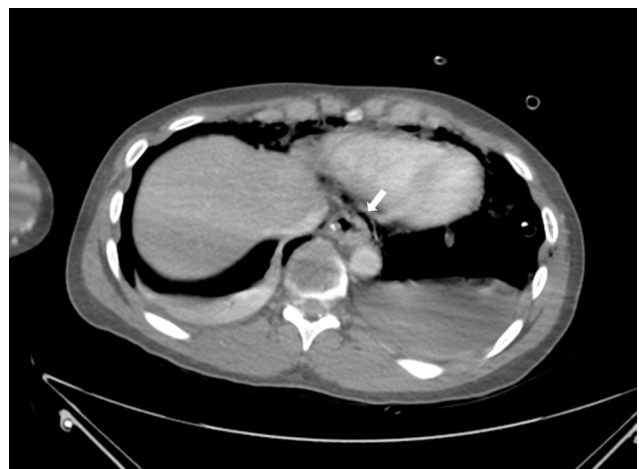
Fig. 2. Chest tomographic axial scan showing mediastinitis (arrow).

inserted in his mediastinum and a 28 Fr. chest tube was inserted in his pleural cavity.