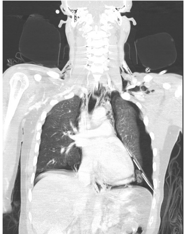
Fig. 1. Chest tomographic scan taken 4 days after blunt injury to the neck, showing pneumomediastinum and bilateral pneumothoraces after tube insertion.

The operation was scheduled and the procedure was done with double lumen intubation. The patient was placed in the right down decubitus position with arm elevated and placed over an arm rest. A full anterolateral thoracotomy incision was done over his 7th intercostal space. Debridement of infected tissue was done and the site of leakage identified. Primary continuous suture was done with antibiotic coated 3-0 vicryl sutures. Pericardium flap below his phrenic nerve was sutured over the suture line. Massive irrigation and a 24 Fr. chest tube was