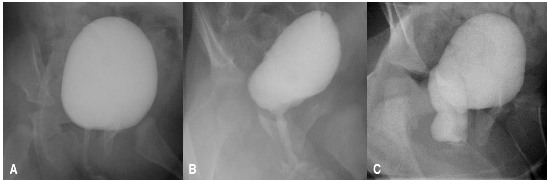
Fig. 1. Vaginal reflux (VR) is classified into 3 grades, based on the modified imaginary scoring system from Kelalis et al. 8) 1973. (A) Grade 0, no visible flow of VR; (B) grade 1, presence of a tracking flow through the vaginal canal, without vaginal bulging; (C) grade 2, presence of a tracking flow through the vaginal canal, with detection of vaginal bulging.

the distribution of the data set. Categorical variables were described as a percentage value, with between-group differences evaluated using a chi-square analysis. Between-group differences in the VR grade were evaluated using a Mann-Whitney U test. A P value < 0.05 was considered significant for all tests.