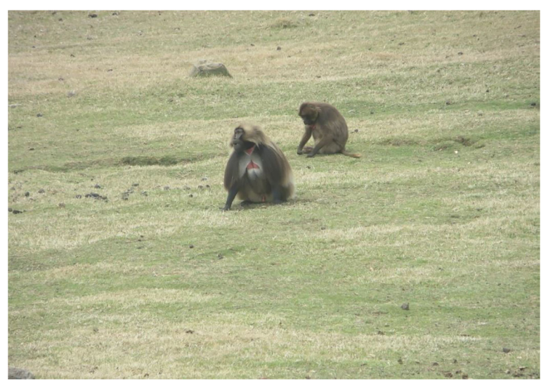
Fig. 1 Adult male and female gelada baboon

The altitude of the area ranges from 2000 to 3730 m.a.s.l. Its topography is characterized by extremely steep slopes whereby the forest is located on the east side of the mountains (Eyosias and Teshome 2015). The area is also found on the division site forming the base for the Blue Nile and Awash rivers. Hence, Wof-Washa is the best