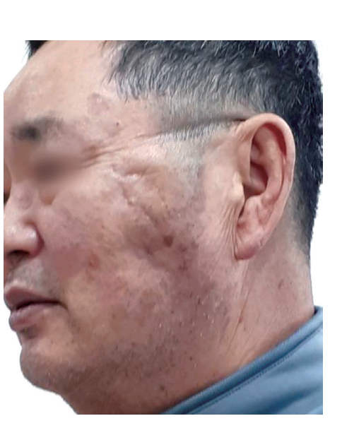
Fig. 6. Postoperative 27-month photograph.

FB impaction in the maxillofacial area is uncommon and a third of FBs are unnoticed in this region [5]. The types of FBs vary widely from nonvegetative materials, such as glass, metal bullets, and stones to vegetative materials [6]. Impacted FBs can cause complications, including infection with pain, swelling, peripheral nerve damage, pseudoaneurysm, and synovitis [6]. Foreign materials are often antigenic and produce chronic inflammatory re-