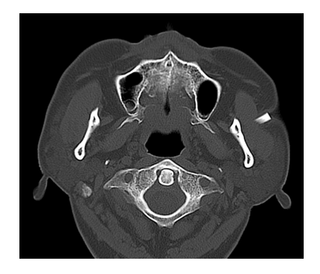
Fig. 3. Computed tomography image showing largest glass fragment.