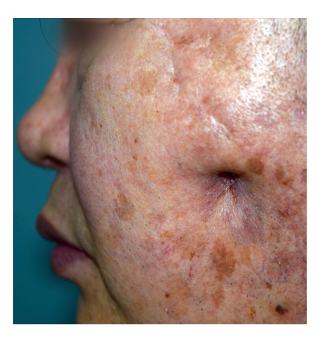
Fig. 1. Preoperative gross photograph.

Saline irrigation and the application of betadine-soaked dressing was performed on the cheek incision for 2 days and the inflammation, which was accompanied by unclear discharge, was alleviated. Under local anesthesia, scar tissue debridement and layer by layer closure were followed. The wound healed without complications. Postoperative facial motor dysfunction and sensory deficit were not observed. Postoperative 27-month photograph showed that the unsightly dimple on the left cheek was greatly improved, and only a slight remnant dimple remained, which could