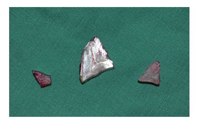
Fig. 5. Removed three fragments of glass.

be attributed to remaining capsular contracture (Fig. 6).