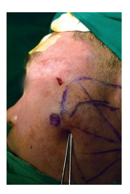
Fig. 4. Intraoperative photograph showing incisions.