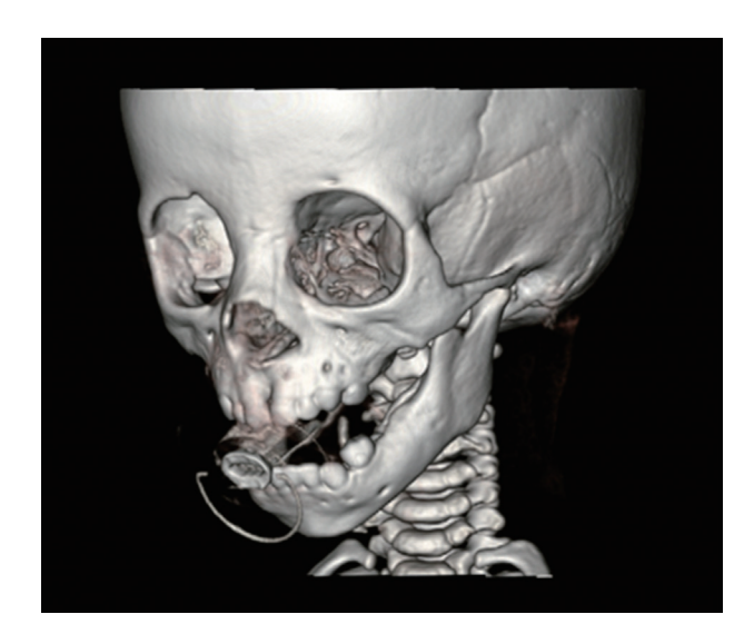
Fig. 5. Postoperative 10-month facial three-dimensional computed tomography. It shows the bony growth of premaxilla and alveolus compared to preoperative computed tomography.

low recurrence rate and high improvement rate of breast feeding [1,3,7]. For mild upper lip tie, simply dividing of frenulum by iris scissor can be the treatment of choice [7]. But this particular case is severe upper lip tie resulting alveolar hypoplasia, abnormal lip motion and contour for child. And it is very rare and needed to release the cord. In this case, upper lip was curling inside because of cord tightness. Thus, we should release inner upper lip by Z-plasty after cord resection.