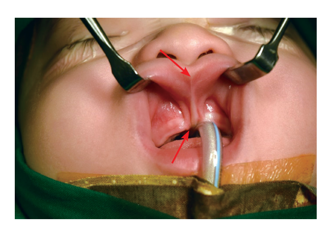
Fig. 2. Intraoperative photograph. There was stout frenulum cord wrapped gum into the anterior premaxilla, and invaded into the alveolus. Eversion of lip was not possible due to the cord tightness (arrows).

It is reported that frenulotomy of upper lip tie alone results in