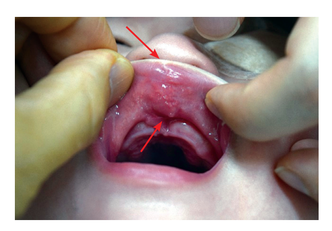
Fig. 3. Postoperative 2 months and 17 days photograph. Cord was resected from premaxilla and gum. Lip was completely released from the alveolus so that upper lip can be everted well after surgery (arrows).